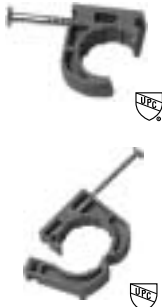
U.S. Patent No. 6,164,604