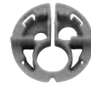
U.S. Patent 6,598,835